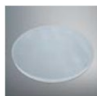
WG7-1 Woven glass