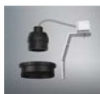
ACOT-83 GU10 Accessory kits