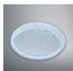
SG7-1 Striped glass