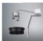
ACOT-82 MR16 Accessory kits